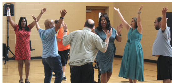
People danced during the festivities at the Pieters Family Life Center in Rochester.