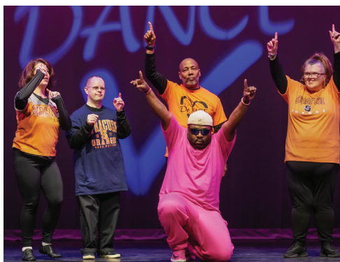
Heart of Dance performers take to the stage.

Heart of Dance delivered a captivating and memorable performance to a full house. Staff members, people supported by the agency and family members took to the stage to put on a dazzling display of movement and dance. This year's performance featured music from genres including reggae, rock, hip-hop, pop and more. †