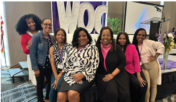
Attendees, organizers and speakers pose for a photo at the kick-off event.

More than 250 people from Heritage Christian Services were welcomed with great hospitality to Bills Camp at St. John Fisher University. Guests enjoyed a private tent with catered breakfast and lunch, as well as a great view of the action. Billy Buffalo greeted the group, and people cheered on their favorite players as they prepared for the season. †