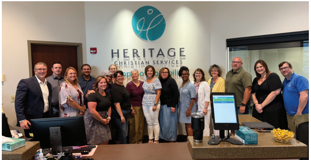
Members of Heritage Christian Services and the OPWDD team converge to validate another Compass designation.