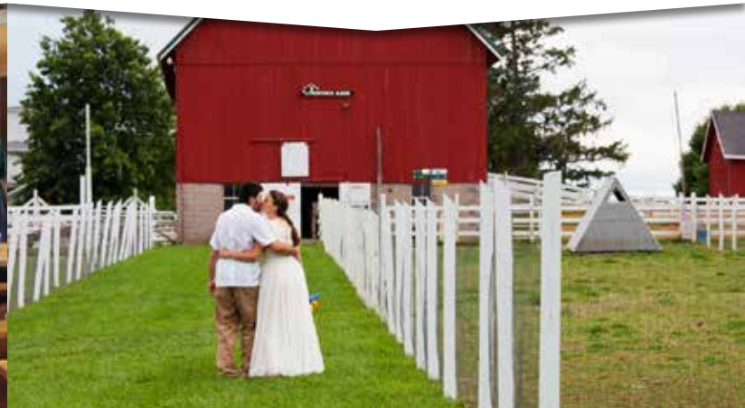
A wedding celebration at Springdale has charm.

For more information visit: SpringdaleFarm.org/rental