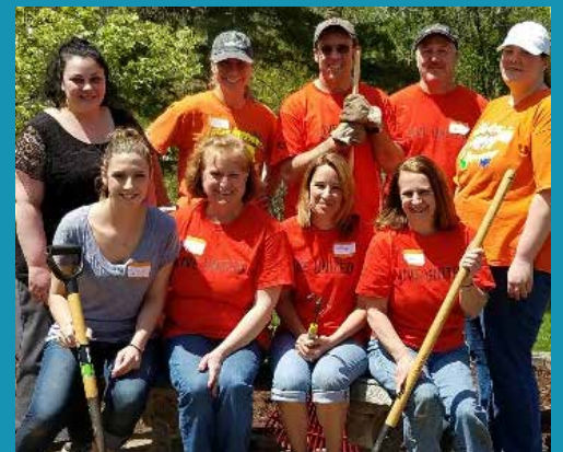
We're blessed by many more volunteers who help beautify Heritage Christian sites during Day of Caring. Pictured left: Ortho Clinical Diagnostics at the Pieters Family Life Center. Right: Harris Corporation at Respitewood.

“AND LET US CONSIDER HOW WE MAY SPUR ONE ANOTHER ON TOWARD LOVE AND GOOD DEEDS, NOT GIVING UP MEETING TOGETHER, AS SOME ARE IN THE HABIT OF DOING, BUT ENCOURAGING ONE ANOTHER...”