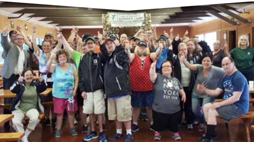
The group at Camp Kenan excited for Reunion Week!